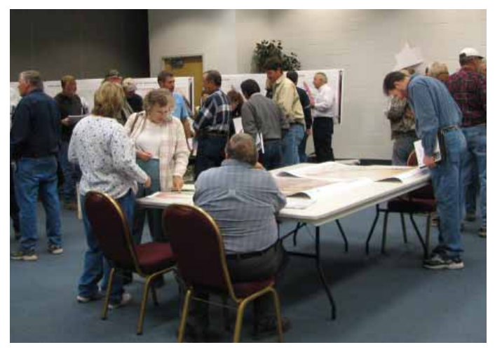
Public scoping meeting in Ontario, Oregon

The public scoping comments received this past fall and winter were summarized in two documents: a Project Order by the ODOE and a Scoping Report by the BLM. The Project Order is available on the project Web site. The Scoping Report will be available on the project Web site after May 15. Both documents will be available for viewing at locations across Oregon and Idaho after May 15 (page 5).